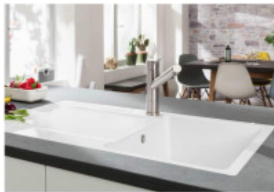
Abbildung: Siluet 50 in Weiß (Ableit) Dieses Schüsselbild ist beispielhaft. Alle Illustrationen entsprechen der Seite der Artikelbeschreibung